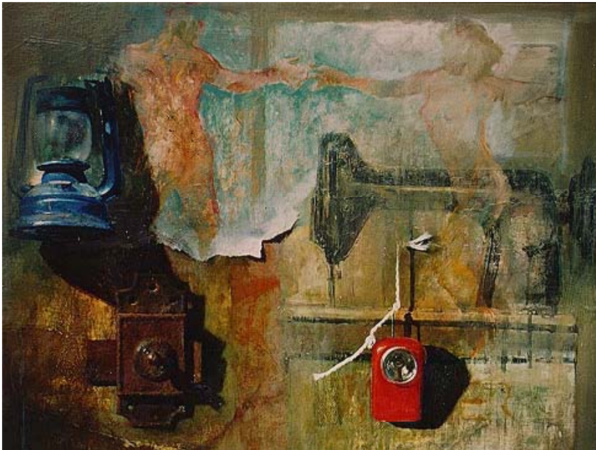
Still life with flashlight