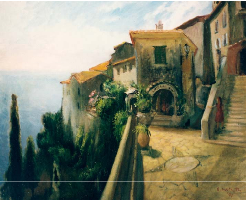
Eze Village (enterance)