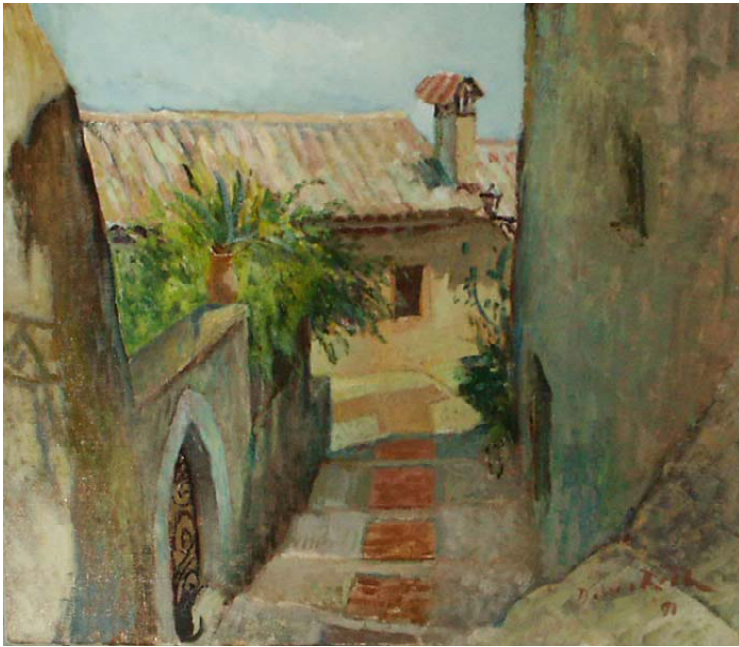
View in Eze