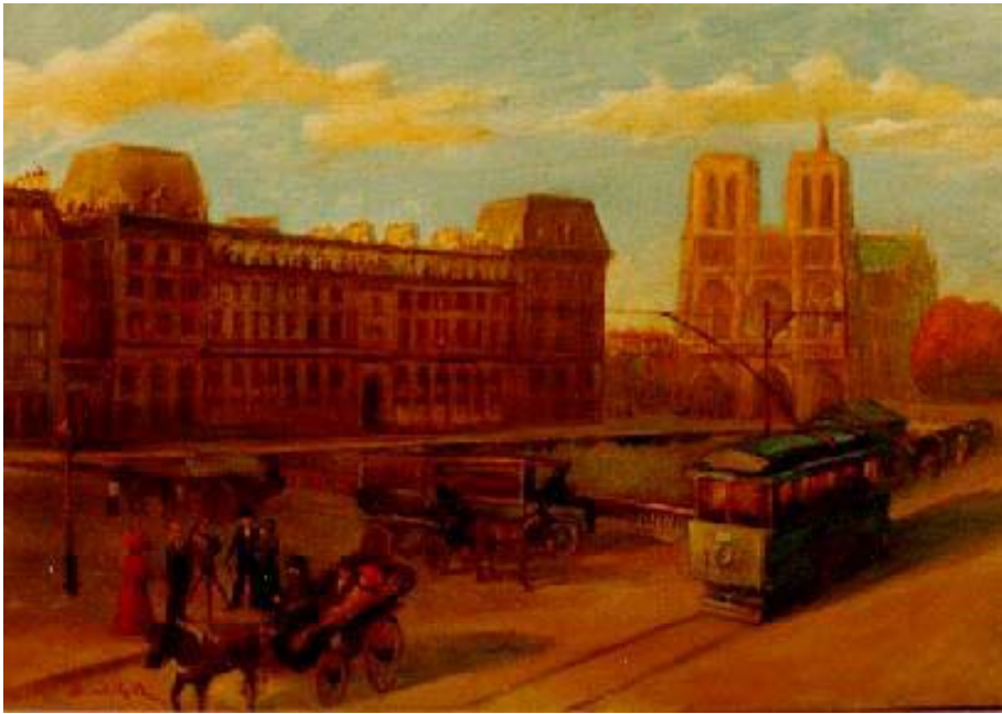
Hotel Adagio Mural (detail)