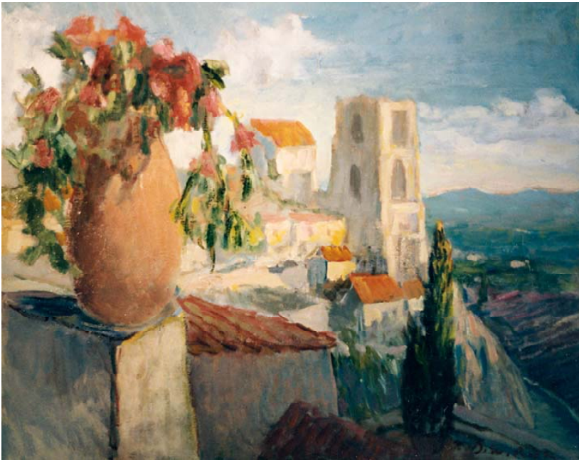
View near Eze