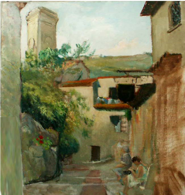
View in Eze