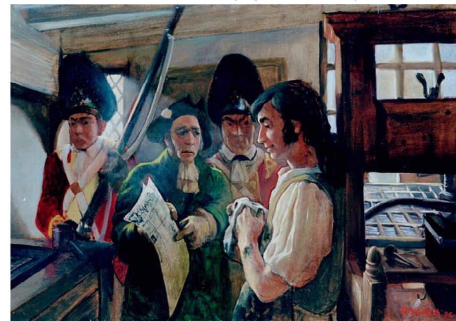
The Summons, Challenging Freedom of Speech