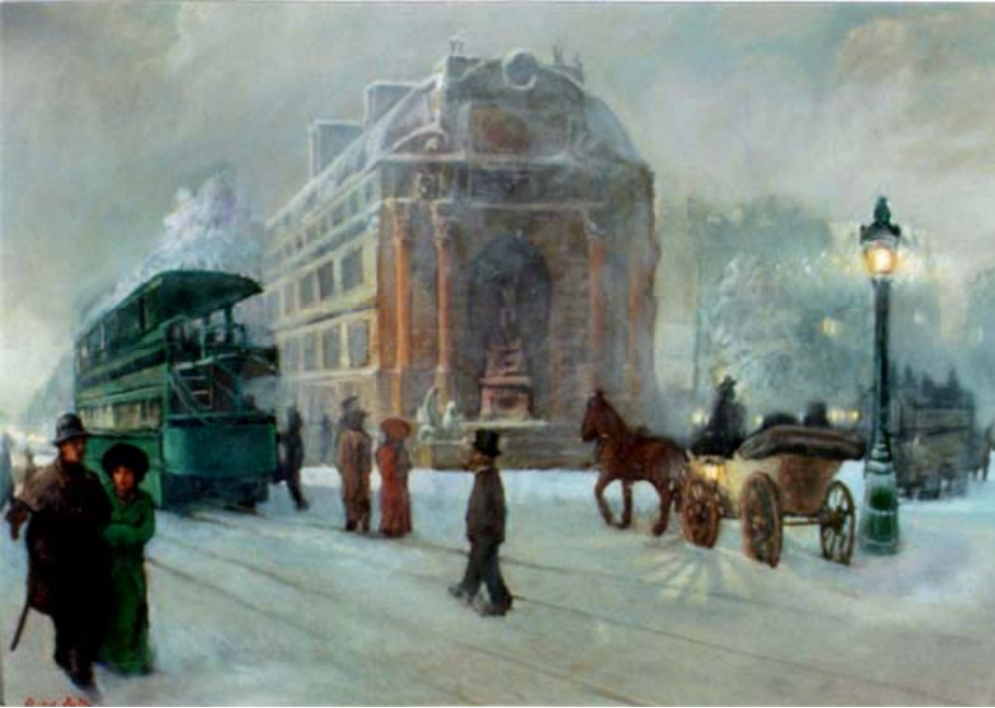
Hotel Adagio Mural (detail)